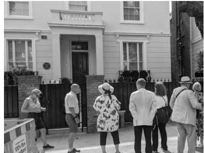
Outside the Birthplace in 2021

The walk will also feature the former residences of more famous music and literary composers and authors along the way and will start outside 93, Hamilton Terrace at 14.00 hours. For your electronic device the Postcode is NW8 9QY and the nearest tube station is Maida Vale.